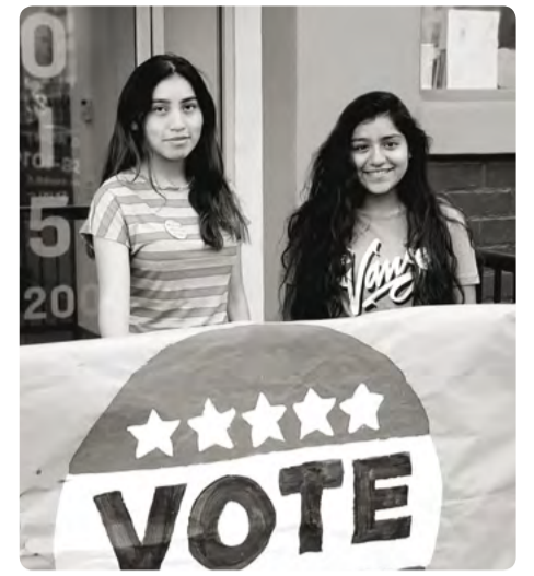
Students from the STOP Club at Miguel Contreras Learning Complex created signs and took to their community to remind folks to vote in the upcoming election, "Every vote matters and every vote can make a change in our lives and for future generations."