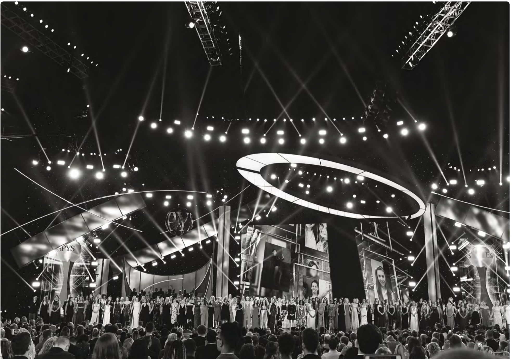
150 of the 300 "Sister Survivors" receiving the Arthur Ashe Award for Courage at The ESPYS.