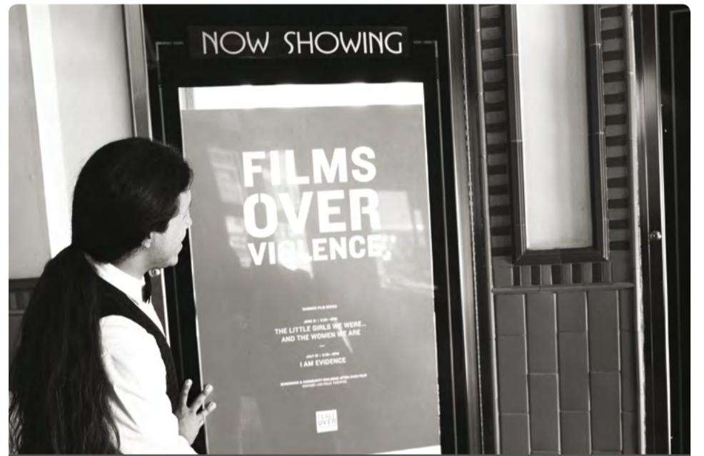
Los Feliz 3 Theater staff showcases POV's first "Films Over Violence" screening poster.