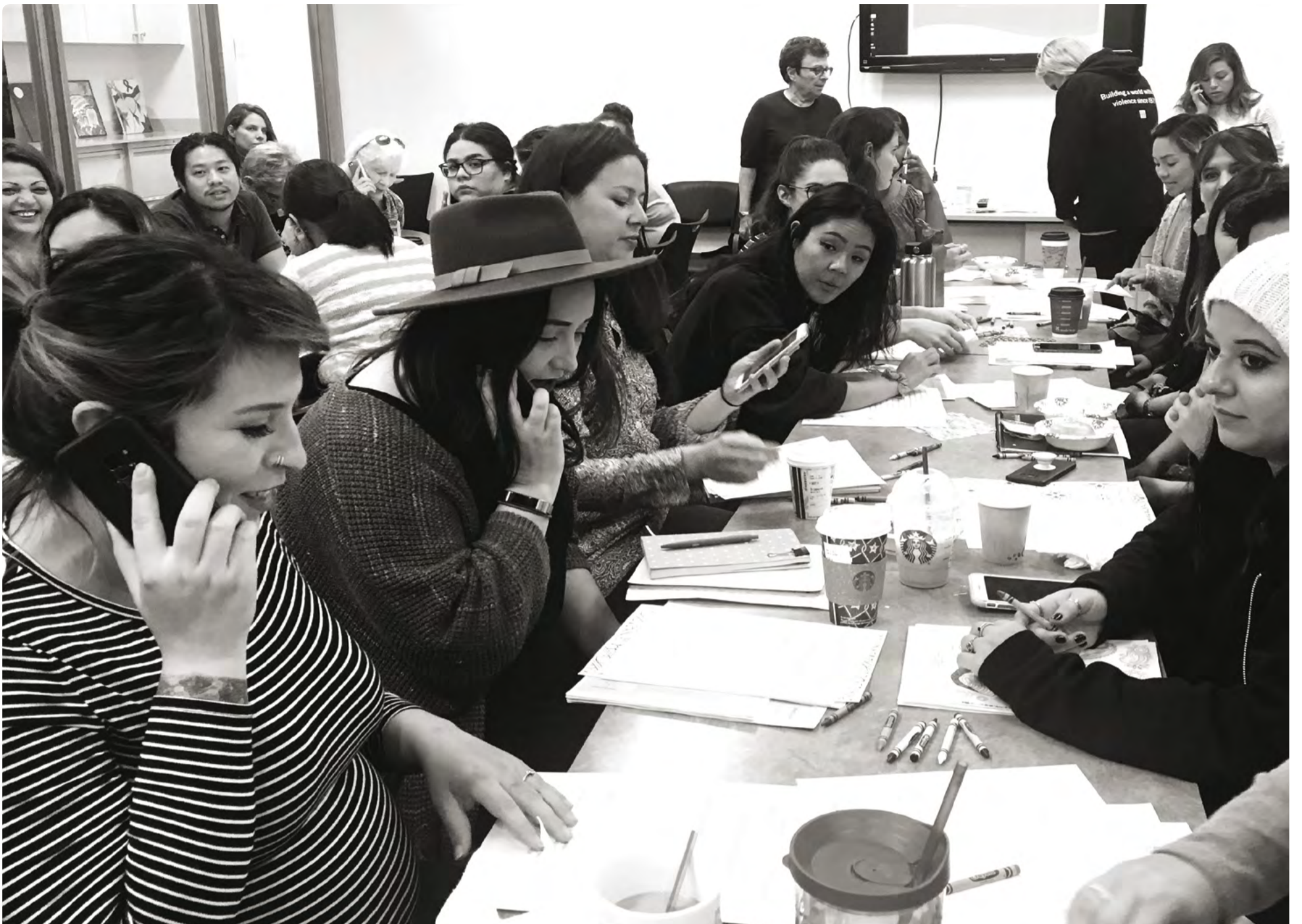
POV staff making calls to senators and congress people to urge support of the Violence Against Women Act.