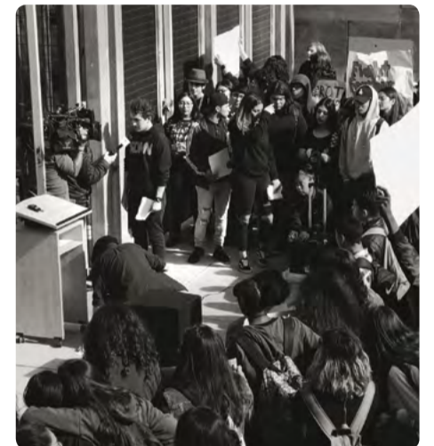
Youth institute graduates from Miguel Contreras Learning Complex were among students who participated in #ENOUGH: National School Walkout to raise awareness about issues of school safety and the impact of gun violence.