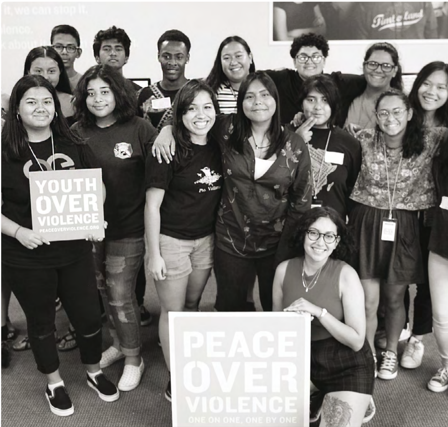
Youth leaders gathered for five weeks over the summer to participate in workshops like Community Organizing, Creative Writing and Digital Media to complete their internship.