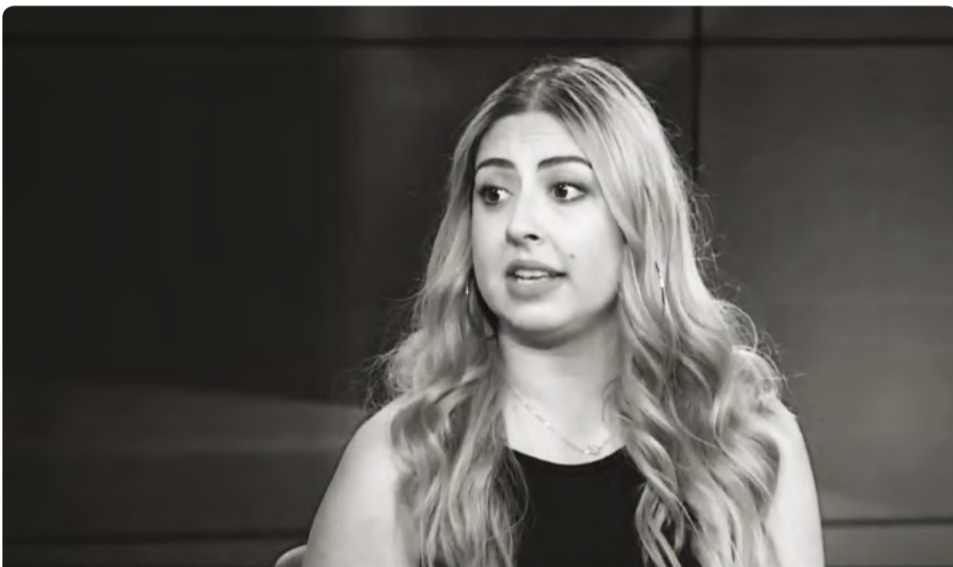
DOMESTIC ABUSE FROM A DIGITAL DISTANCE Smart devices used to torment and confuse